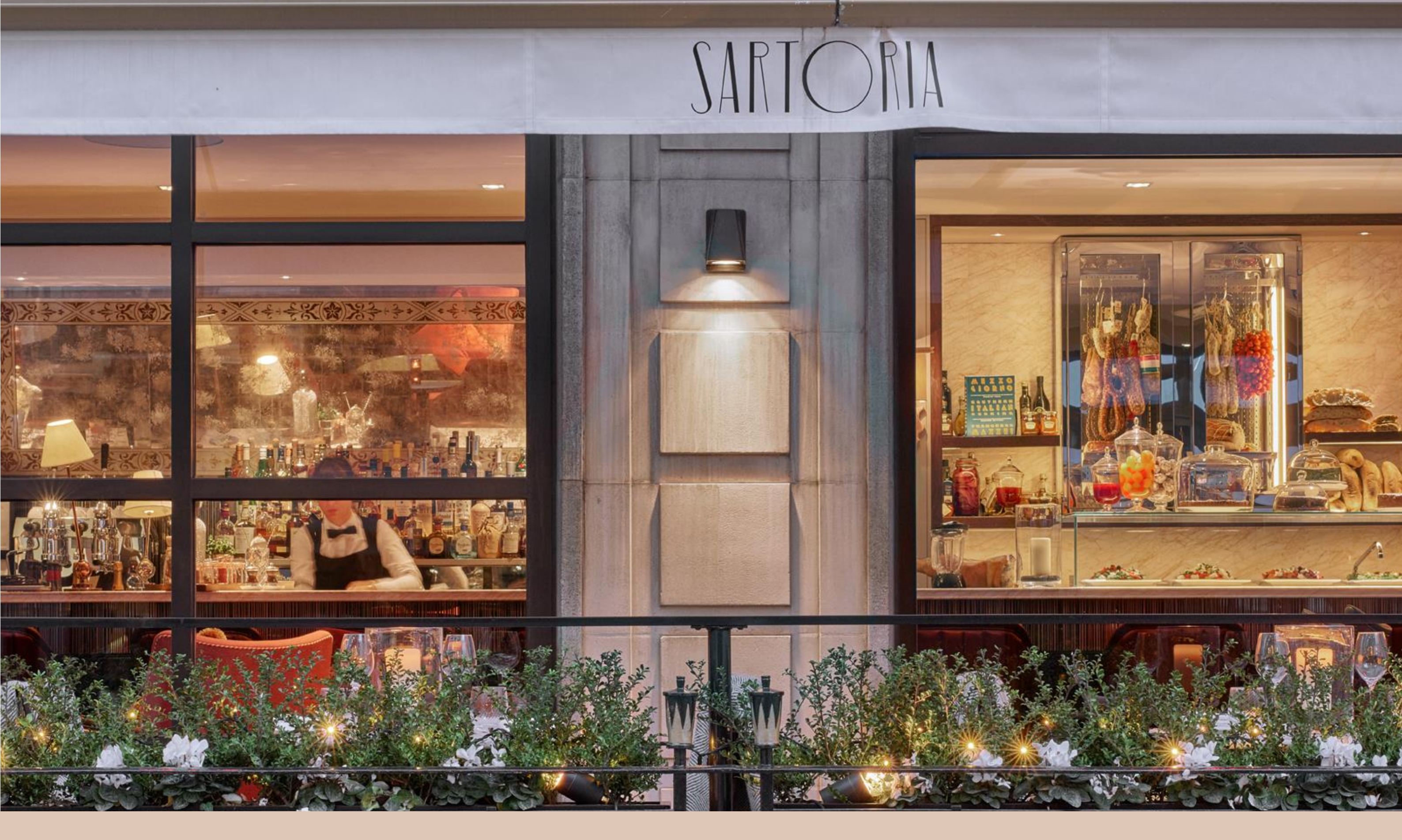
EVENTS at SARTORIA